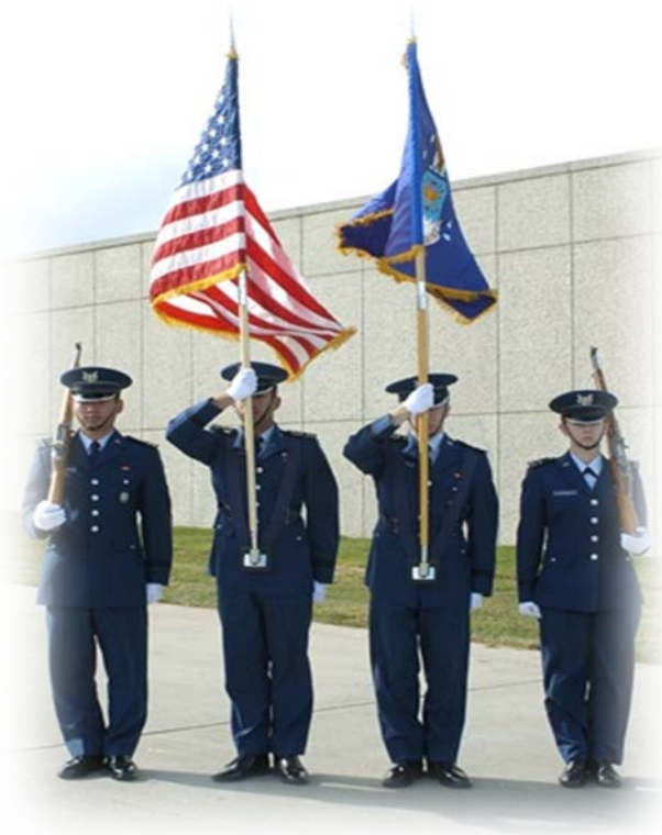
Cadet Honor Guard

Honor Military Junior Reserve Officer Training Corps (JROTC) Schools and Air Force Reserve Officer Training Corps (AFROTC): There is a maximum of 20 appointments total for all of these categories combined. Honors with distinction military schools are designated by the Department of the Air Force, Army, Marine Corps and Navy to nominate Academy candidates annually from among their honor students. Each honor unit may nominate five students to compete for the vacancies. Five students from each AFROTC detachment may be nominated to compete for the authorized vacancies. Air Force ROTC Students should apply for a nomination to their professor of aerospace studies or aerospace science instructor who will recommend nominees to the head of the institution.