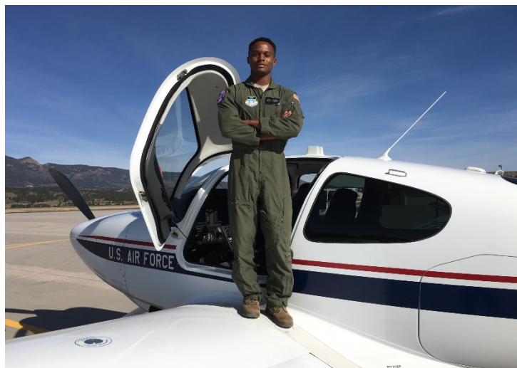
T-53 (Cirrus SR20)

NOTE: You must take every subtest of the ACT and SAT. We will not accept the test scores if you did not take all subtests (English, Math, Reading, and Science Reasoning for ACT and Evidenced Based Reading and Writing and Math for SAT).